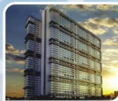
Kanakia Level Malad