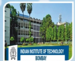
IIT Powai Mumbai