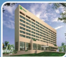
Holiday Inn International