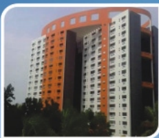
Raheja Garden Thane