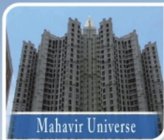
Mahavir Univers Bhandup