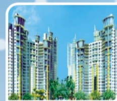
City of Joy Mulund