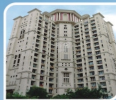
Lok Everest Mulund