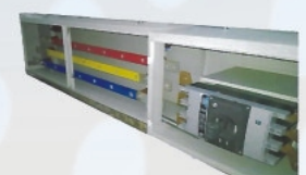
Bus Bar Panel